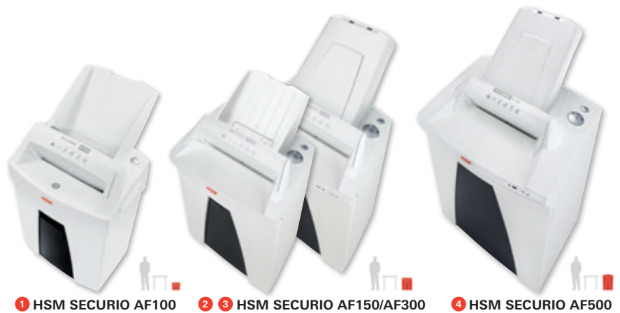
1 HSM SECURIO AF100 2 3 HSM SECURIO AF150/AF300 4 HSM SECURIO AF500

Hinged magazine for paper stacks, HSM SECURIO AF300 and AF500.