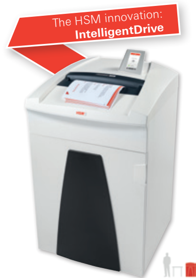
14 15 16 HSM SECURIO P36i/P40i/P44i