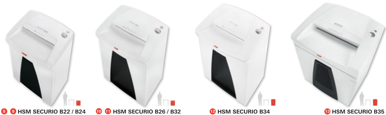
8 9 HSM SECURIO B22 / B24