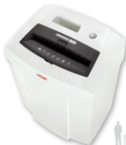
5 HSM SECURIO C14