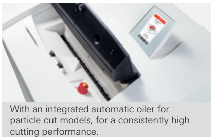
With an integrated automatic oiler for particle cut models, for a consistently high cutting performance.