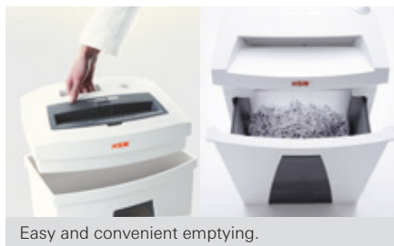
Easy and convenient emptying.