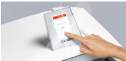
Intuitive operation and multi-language menu selection via the 4.3" touch display.