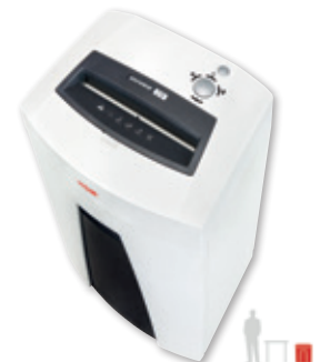
7 HSM SECURIO C18