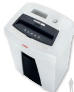
6 HSM SECURIO C16