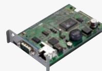
ACC-2000 KVM IP Console Module