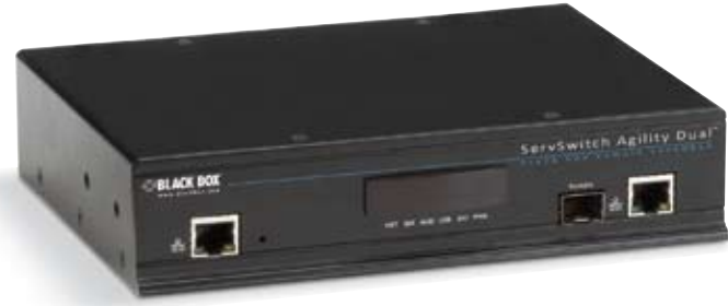
ServSwitch Agility Dual-Head DVI Receiver (ACR1002A-R)