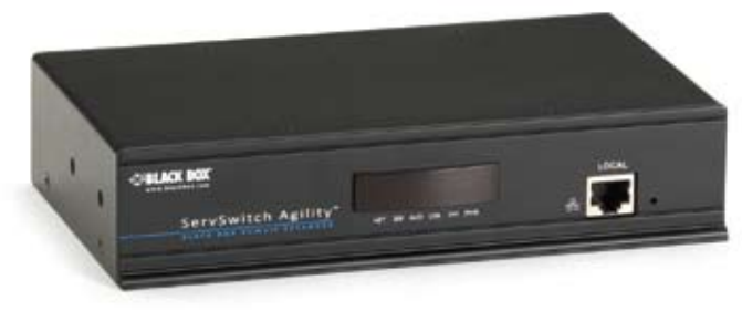
Front view: ServSwitch Agility Single-Head DVI (ACR1000A-T)