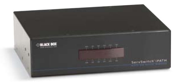
ServSwitch Agility Controller (ACR1000A-CTL)

With dual-link support, you can use the Agility receivers with extra-large HD screens, such as displays used for broadcasting, digital film, or high-end graphics editing, as well as dual-monitor setups, as used in medical imaging or process engineering. Use two DVI-D monitors at a remote workstation for maximum productivity and viewing capabilities.