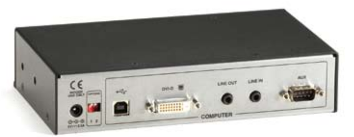
Rear view: ServSwitch Agility Single-Head DVI (ACR1000A-T)