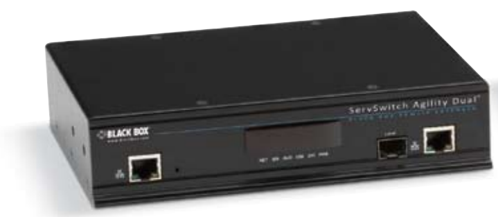
ServSwitch Agility Dual-Head DVI Transmitter (ACR1002A-T)