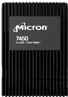
U.3: 7mm and 15mm

Designed as a mainstream solution, the 7450 SSD balances performance and density. Our offering includes a PCIe Gen4, M.2, 22 x 80mm with power-loss protection 4 and a 7.68TB E1.S that delivers industry-leading capacity. 5